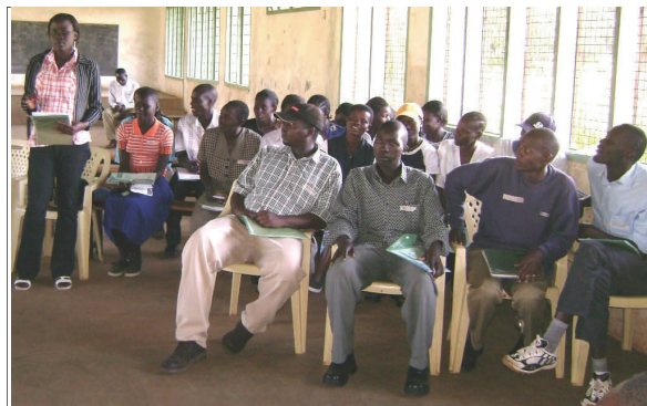
Participants following proceedings at the peer education training at Kombewa. Parents should take lead in educating their teenage children about reproductive health