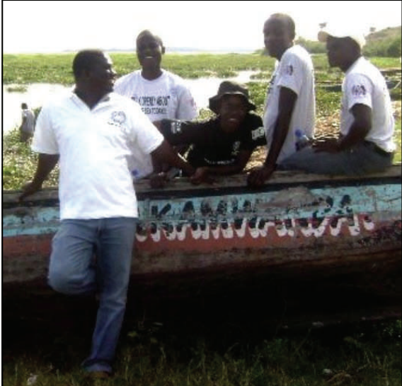
PIRH staff and volunteers relax at the lake after a mobilization exercise. Part of the mobilization is to enlighten the population about HIV prevention mechanisms including Male Circumcision